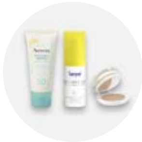
Acne & Skincare