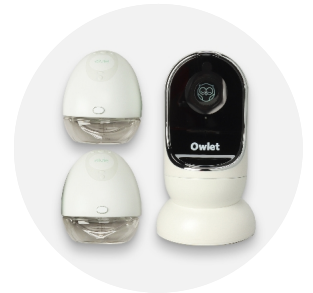
Baby & Mom

$960 Have an FSA? Consider contributing the full amount allowable annually — you could save up to $960 on health expenses!*