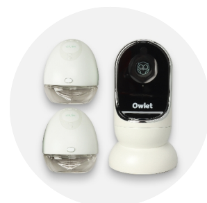
Baby & Mom